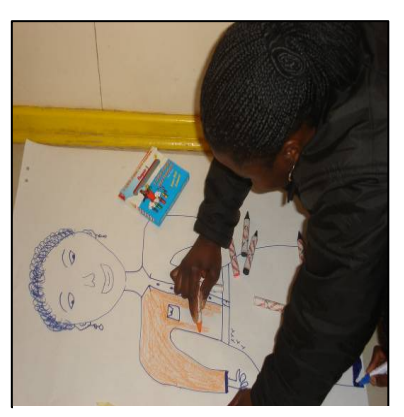
Above: An Africare appreciative inquiry participant draws a metaphor for Africare — in this case a mother to the community.

Africare is an international NGO operating in South Africa and, more specifically, in the Eastern Cape, since 2002. Africare offers hospital-based, Department of Health (DoH) service rollout. The organisation initially focused on care and support, livelihood and nutrition (permaculture), community prevention programmes and monitoring and evaluation. In scaling up its initial project scope, Africare South Africa (hereafter referred to as Africare) found inspiration in an OVC project component underway in Zimbabwe during 2002, which focused on orphans and vulnerable children. During September 2006, the Hewu project, better known among locals as "Injongo Yethu" (meaning "our own purpose") HIV/AIDS project was established. Emphasis is placed on service delivery, with both project components (comprehensive HIV/AIDS care as well as OVC) being implemented in the Emahleni/Chris Hani districts, thus including more focus on peri-urban settlements such as Whittlesea and Sada.